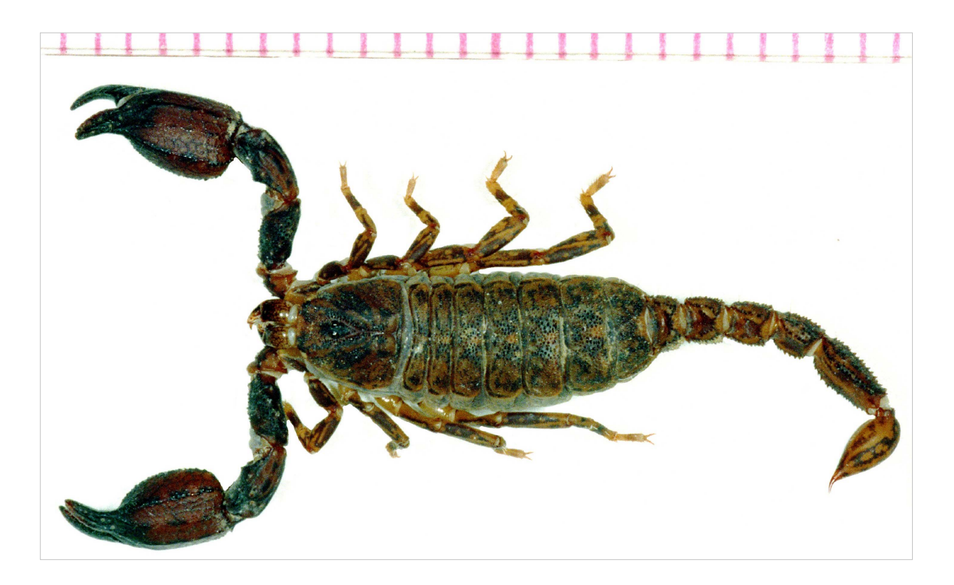
Figure 8: Chaerilus petrzelkai Kovařík, 2000, female holotype, dorsal aspect.