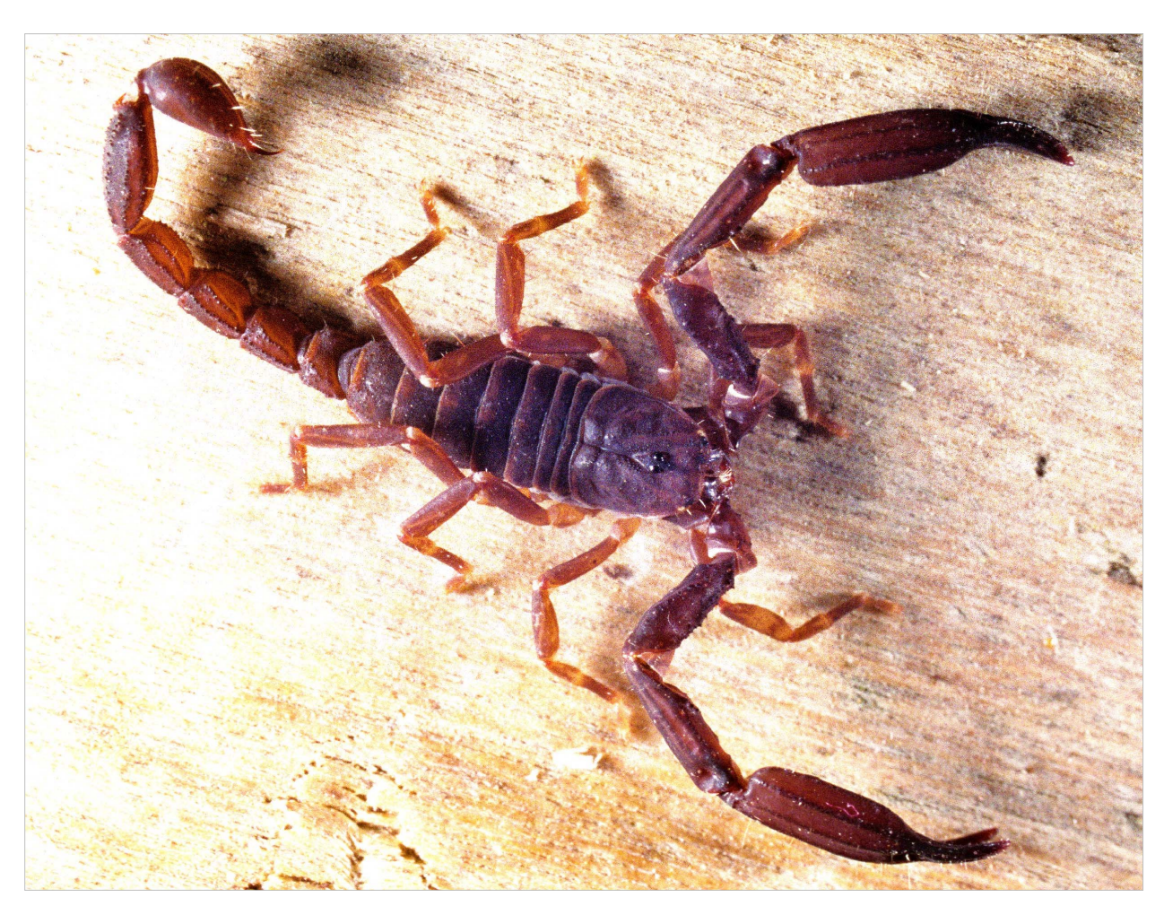
Figure 9: Chaerilus rectimanus Pocock, 1899, male from Malaysia, Bukit Fraser, elev. 1500 m, 1.VIII.1999, leg. J. Hromádka, live

internal tubercle on the patella of pedipalp. Also the shape of the patella and chela of pedipalp are different (see Figs. 5 and 9).