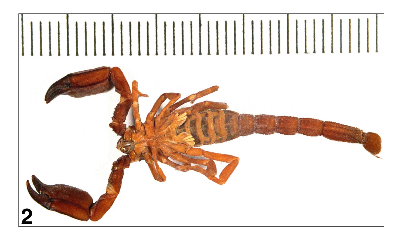
Figures 1–2: Chaerilus ojangureni sp. n., male holotype: 1. dorsal aspect; 2. ventral aspect.