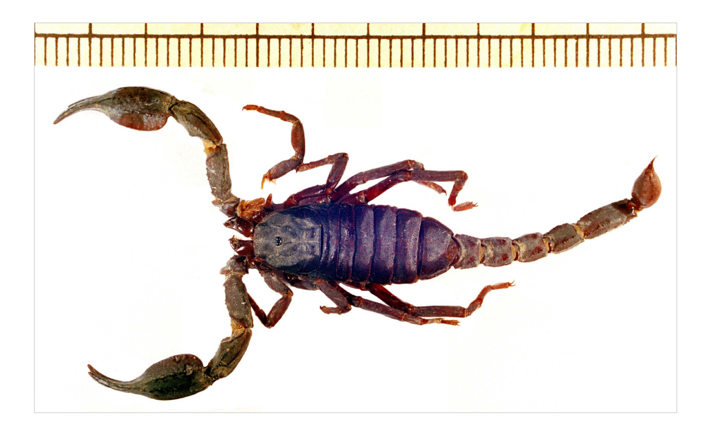
Figure 4: Chaerilus laevimanus Pocock, 1899, female holotype, dorsal aspect.