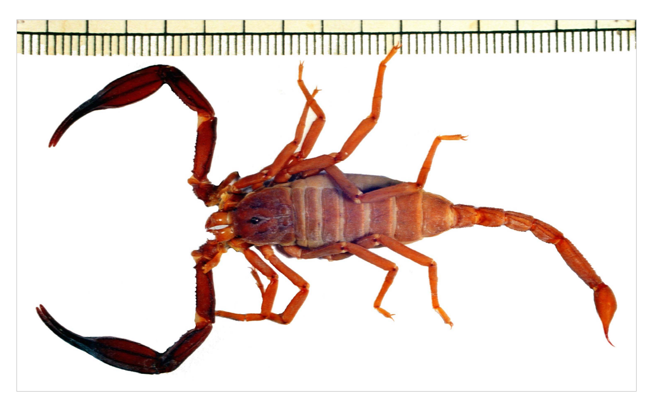
Figure 3: Chaerilus agilis Pocock, 1899, female holotype, dorsal aspect.