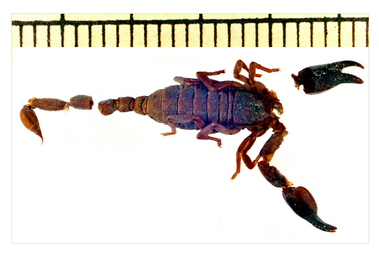
Figure 7: Chaerilus celebensis Pocock, 1894, female holotype, dorsal aspect.